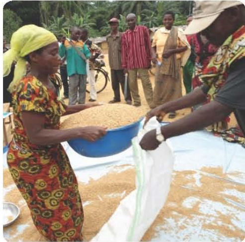
In November 2011, members of the community repay their loans with part of their rice harvest. The loan project was conducted by the Anglican Diocese of Kindu at Katimba village, Kindu, Democratic Republic of the Congo.