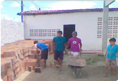
Above, members of the community volunteer to move materials used in the construction of the new building, the Right Rev. Robinson Cavalcanti Anglican Center of Holistic Mission. It is located in the neighborhood of Valentina de Figueiredo, Brazil. Below, a mime tries to communicate the Gospel message at an outreach event.